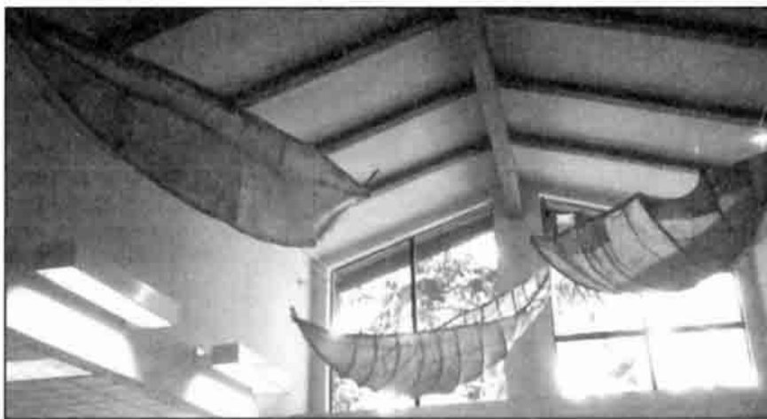
Vanbianchi boats hang above library's east reading area

Most of the work will hang in the library's large meeting room on the main floor.