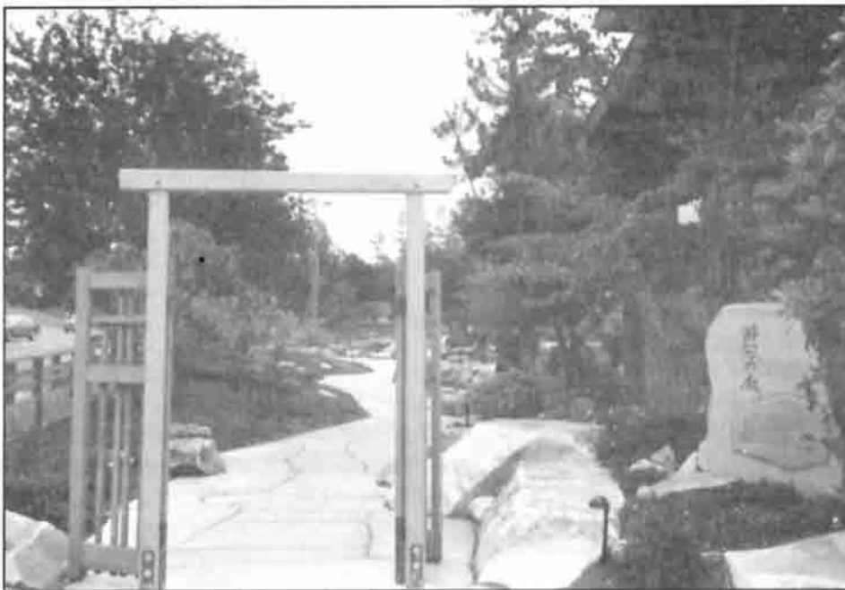
The entrance to the Haiku Garden